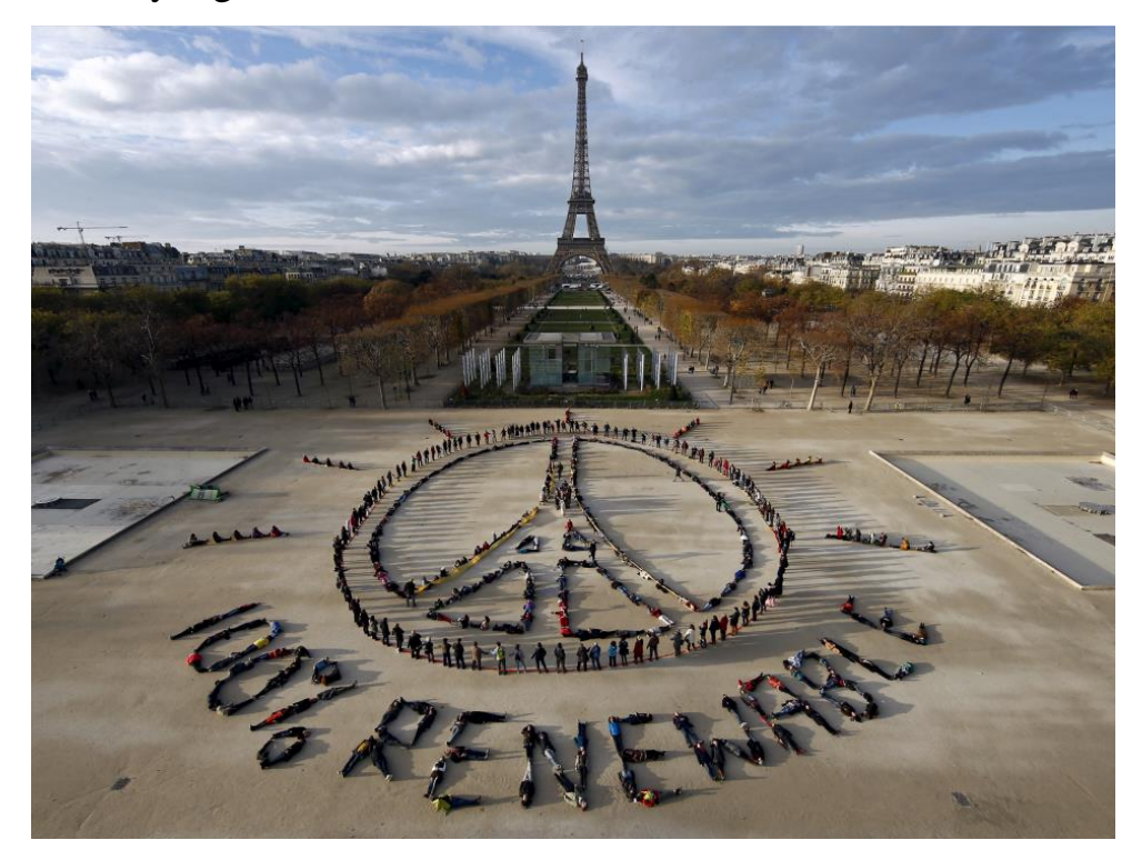
Figure 2: Activists demonstrating for 100% renewable energy at COP21 in Paris.